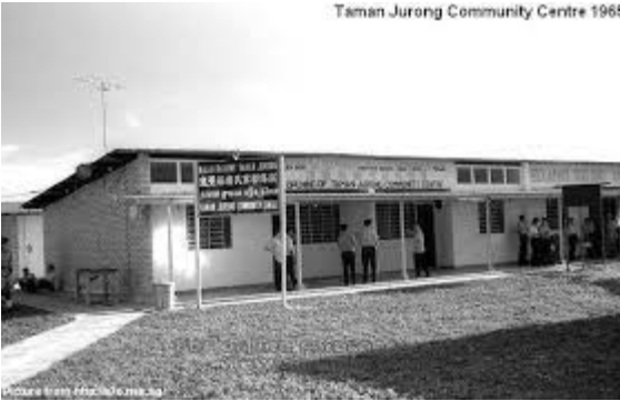
Taman Jurong Community Centre 1965

The 50 years of changes, with skyscrapers replacing low-rise buildings, can be viewed as impressive, unimaginable 50 years ago. Maybe you would like to note that on 9 th August 1965, there was no Jurong Christian Church, and Tah Ching Road was then known as Taman Jurong 12. 1 The Taman Jurong CC