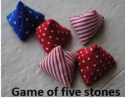
Game of five stones

school hours for remedial lessons or extra-curricular activities.) There was also an open-air badminton court in front of my block. I played skipping (with ropes made from rubber bands) and five stones with boys and girls together. Among the boys, we played goli (marbles). We played hantam bola (throwing a tennis ball at one another) in the open field, getting ourselves dirty with mud stains on our clothes and prepared for a scolding when we reached home.